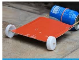
DIY-RUBBER BAND RACER

(Ask an adult to help when cutting and gluing)