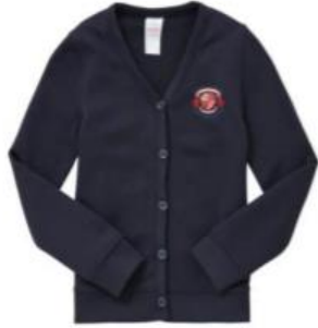
Cardigan (Navy Blue)