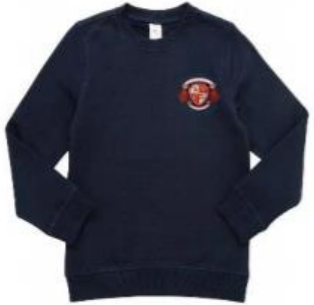
Sweatshirt (Navy Blue)

Be SMART and dress the “Stockton Wood Way!”