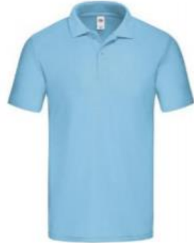
Polo Shirt (Sky Blue)